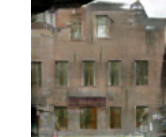
P_{0.5}(w, f) \rightarrow Q_8(w, f)