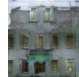
P_{0.5}(w) \rightarrow Q_8(w, f)